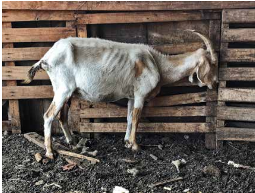
Figure 3. Adult female goat, which presents loss of body condition, respiratory difficulty, and skull pressure 84 h post-ingestion of feed administered in troughs

There were no alterations in size and morphology at the hepatic level. Histopathological lesions included marked multifocal necrosis of contractile myocardocytes with heterogeneous coloration, pale and eosinophilic areas, pyknotic nucleus, rupture of myofibrils, mild lymphoplasmacytic infiltration, incipient fibrosis areas in more affected areas, and structures compatible with Sarcocystis spp (Figure 4 A-B). In the lung, edema and mild diffuse interstitial hemorrhage were found. In the kidney, interstitial hemorrhage and mild tubular degeneration with the presence of intraluminal cell debris were found. In the reticulum, rumen, omasum, and abomasum, mild mononuclear inflammatory infiltrate, hyperemia, congestion, and bleeding in the lamina propria were also noted. Hepatocytes, hydrophilic and vacuolar degeneration was found in the centrilobular area. During the inspection of the farm, N. oleander leaves were found mixed with the other forage in the troughs. Some of them were green while others were dry, and they showed evident marks of having been chewed.